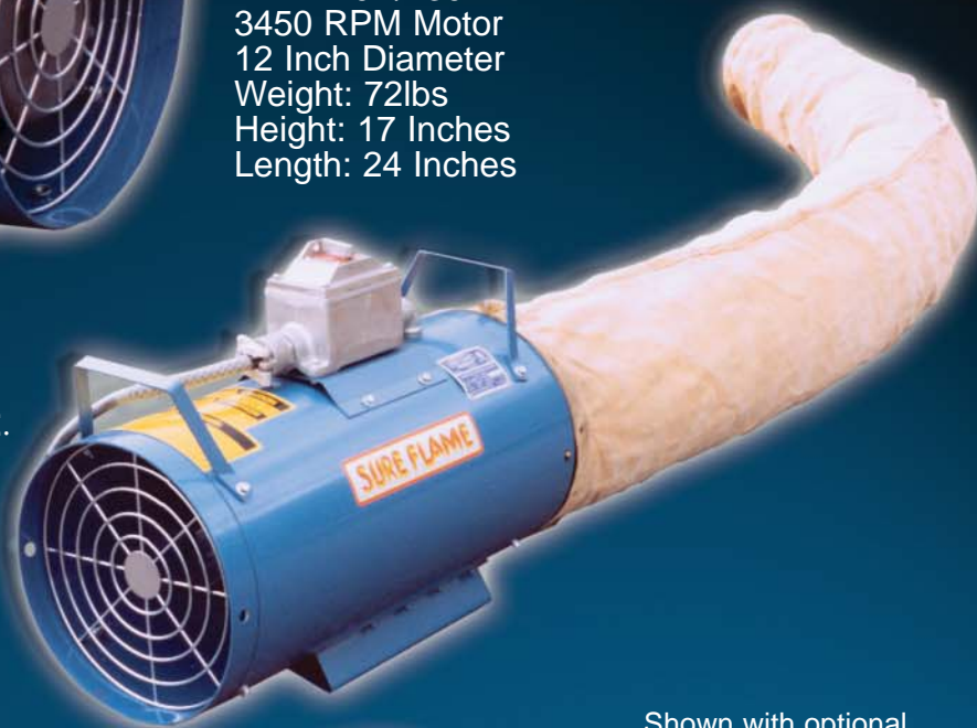
Shown with optional 18" duct transition